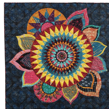
Robin Ruth Designs