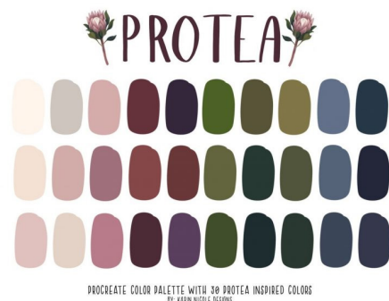
Opp quilt color scheme