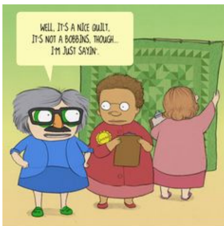
Mrs. Bobbins subtly tries to influence the quilt show judges.