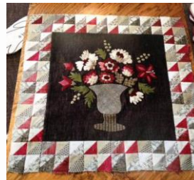
Floral Urn Workshop

Do visit the Programs table to see this GORGEOUS workshop project that features silk, wool, home dec and embroidery in the most yummy colors! No doubt this small quilt will become the favorite hand project to carry you thru the crazy holiday preps! Register for this workshop at your next chapter meeting, it is going to be something very special! A kit will be available for purchase at the workshop!