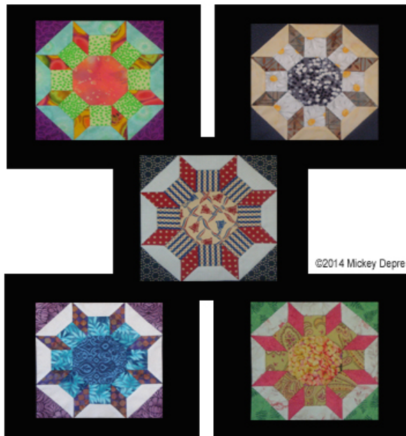
Castle Wall- The Block

The kit includes the acrylic templates for a 9" block, a sheet of CJ Jenkins freezer paper, a spool of Aurifil thread, and a package of Richard Hemming needles. There is also a supply list of basic sewing supplies, including fabric, so pick one up when you register for the class or check the PSQG web site.